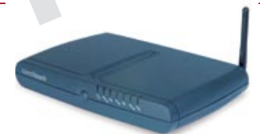
SpeedTouch 706WL - 780WL